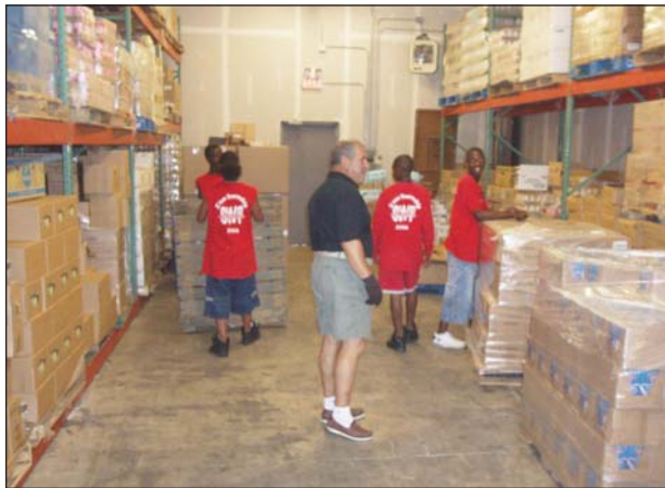
One Summer Work Program work crew helped every Monday to prepare Faith Food Pantry for food distribution, and every Wednesday with food distribution.

Zion Township and Six Flags Great America joined forces to give area youths 15 and older a more readily available opportunity to work at Great America. Interviews for interested youth were held throughout the community and 35 total youths worked at Great America from June 14 th through August 27 th . These employees were also given the opportunity to take advantage of a transportation program coordinated through Zion Township with Zion-Benton Township High School. Next year, alternative transportation options will be presented to interested youth.