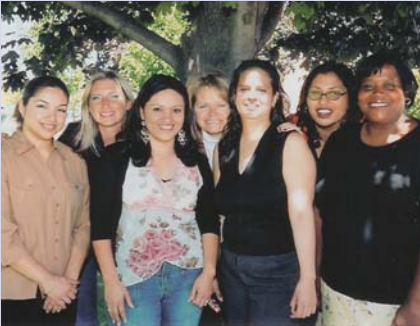
Zion Township Staff