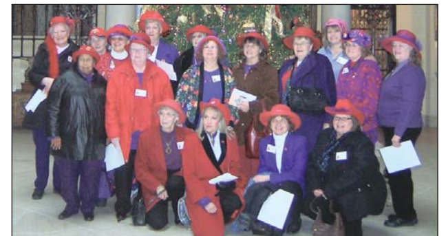
The Queen Bees of Zion Red Hatters gathered for a fun holiday picture.

Zion Township partners with the Zion Park District to host a Senior's Luncheon on the first Wednesday of each month at 10:00 a.m. at the Shiloh Senior Center (27 th & Emmaus in Zion). The luncheon is open to all Zion seniors and features entertainment. The Township partners with the Zion Park District by covering the meat cost for the meals. Please contact the Park District at 847-746-5500 for more information.